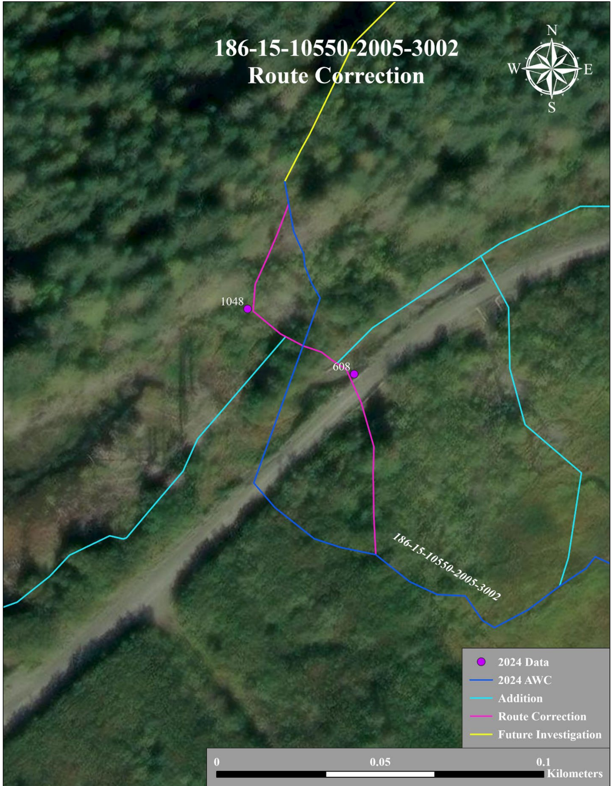
Figure 3.—186-15-10550-2005-3002 route correction map.