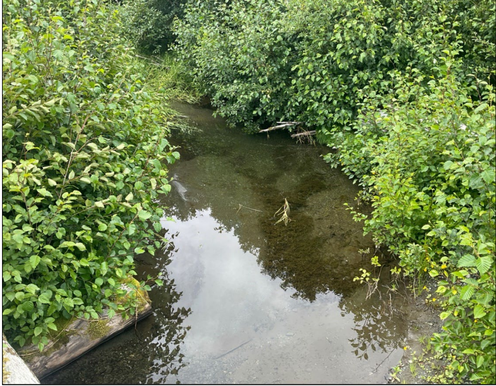
Figure 1.—Looking upstream at the main channel.